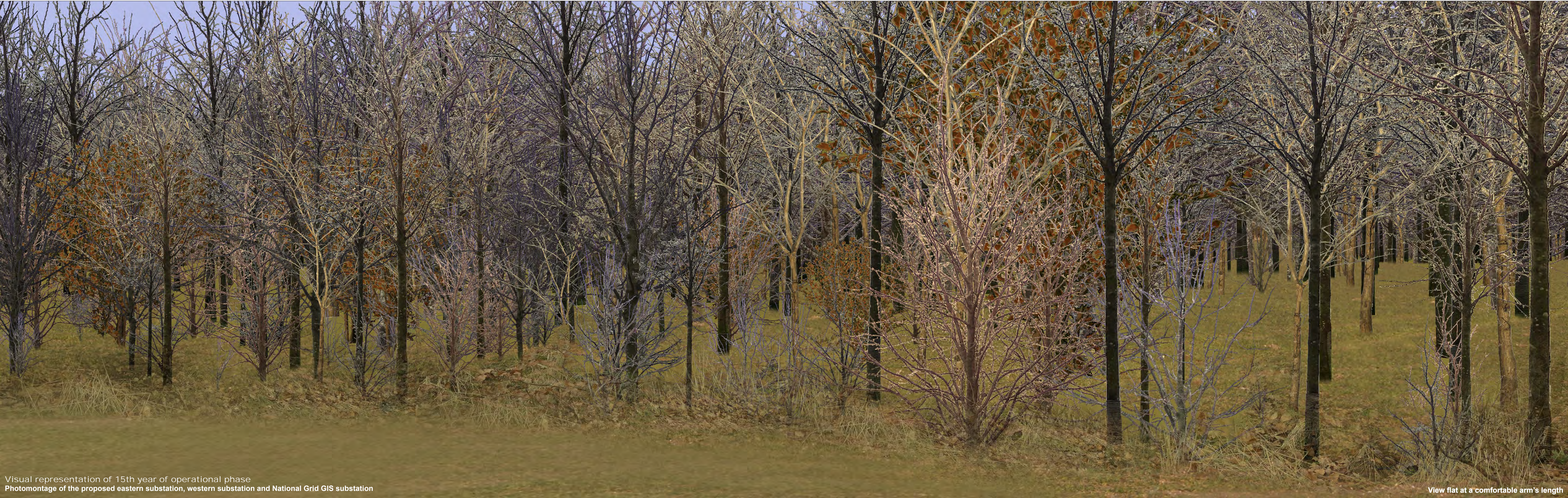
Visual representation of 15th year of operational phase Photomontage of the proposed eastern substation, western substation and National Grid GIS substation