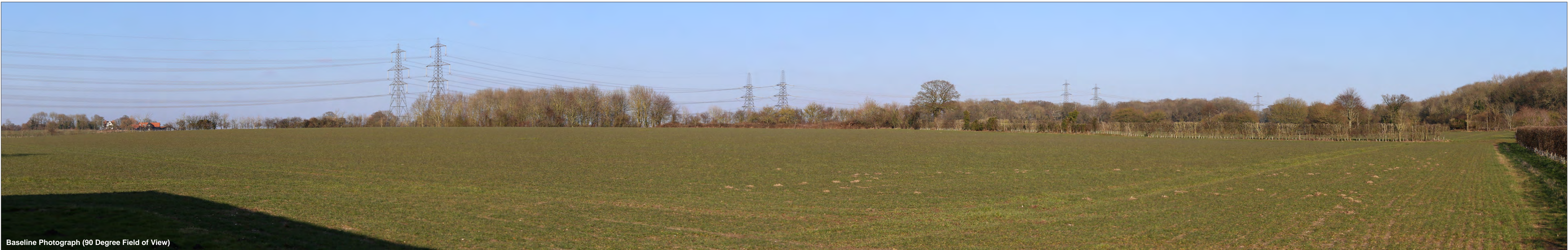
Baseline Photograph (90 Degree Field of View)